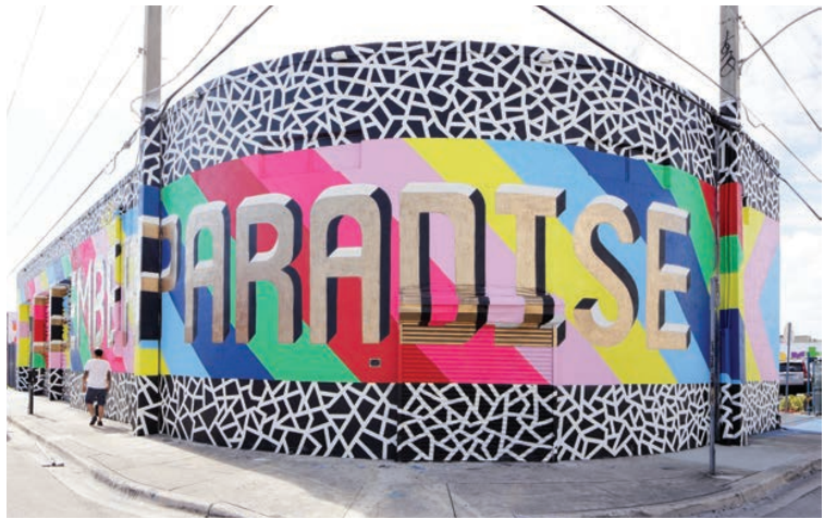
Right: Thoughtful exterior designs such as murals and decorative wraps beautify commercial spaces and deter vandalism in the first place.

types of anti-graffiti coatings and the key considerations for selecting the best materials for different surface textures and conditions.