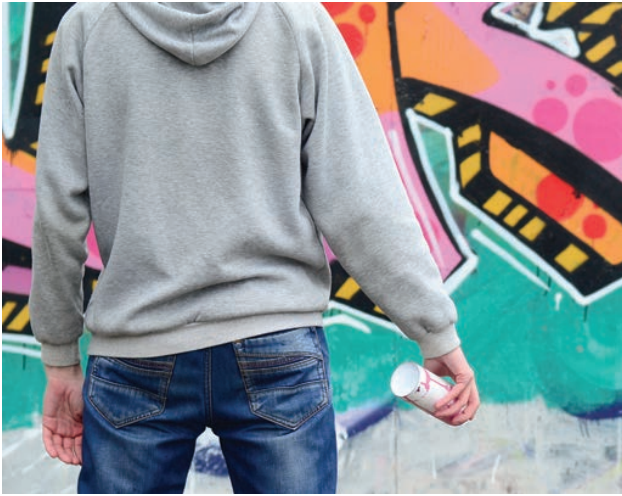
Top: Unlawful defacing costs an estimated $12 billion annually in the United States. In some states, business owners may incur fines if graffiti is not cleaned up promptly, according to the U.S. Environmental Protection Agency.