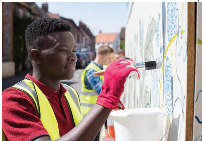
Community engagement is key. Involving local artists in commercial property design can foster community pride and discourage graffiti.

The effectiveness of anti-graffiti measures is closely tied to how quickly graffiti is removed. Specifiers should advise clients to clean up graffiti within a few days to prevent re-tagging. This swift response disrupts the gratification vandals seek from their work, often discouraging them from targeting the property again.